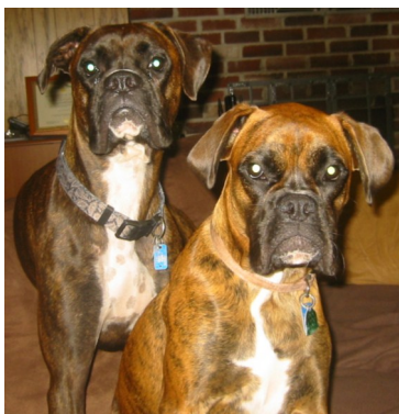
Roscoe & Daisy