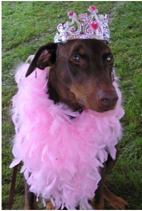
Bark Park Queen Ruby