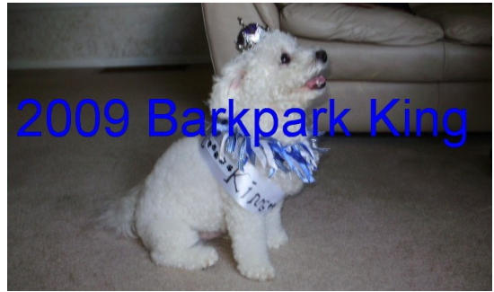
Bark Park King Bugs